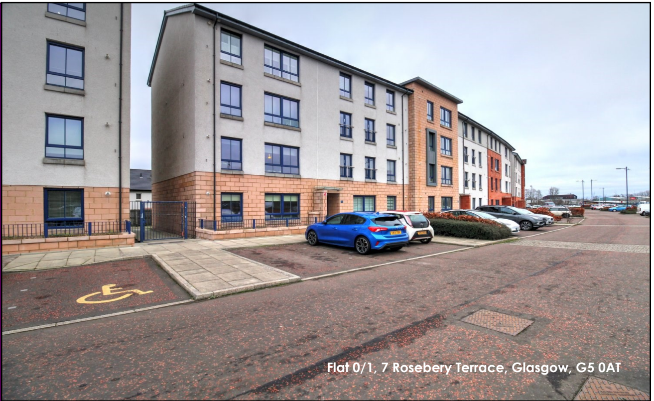
Flat 0/1, 7 Rosebery Terrace, Glasgow, G5 0AT

A well-presented one bedroom ground floor apartment enjoying a prime position within this much admired and conveniently located modern development. Presented to the market in excellent order throughout this bright and tastefully decorated modern apartment will not fail to impress upon inspection. Boasting generous proportions, the light and airy interior